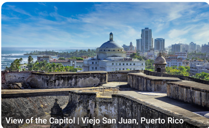
View of the Capitol | Viejo San Juan, Puerto Rico

Like other incentives in Puerto Rico, the IFE tax benefits can interplay with other Incentives Code benefits (i.e., individuals), resulting in dividends received being fully exempt from Puerto Rico income tax. Dividends paid would also be excluded from federal income tax to the extent they are Puerto Rico-sourced income, and the recipient of the dividend is a bona fide resident of the island.